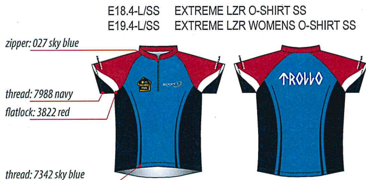
E18.4-L/SS EXTREME LZR O-SHIRT SS E19.4-L/SS EXTREME LZR WOMENS O-SHIRT SS