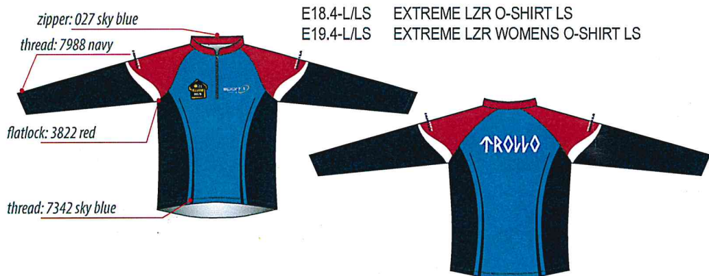
E18.4-L/LS EXTREME LZR O-SHIRT LS E19.4-L/LS EXTREME LZR WOMENS O-SHIRT LS